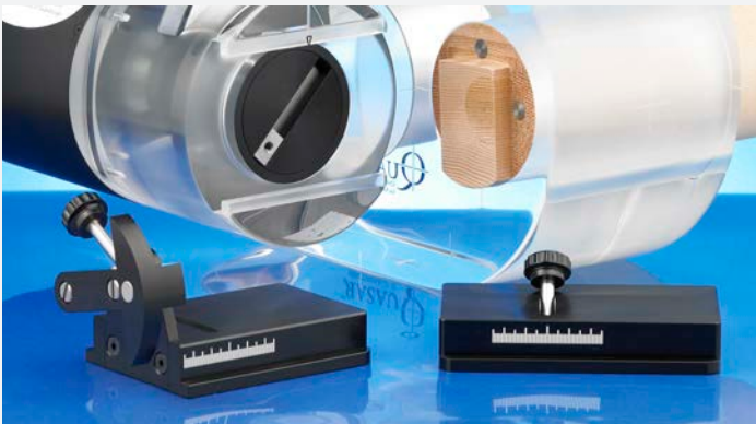
Above: Optional Rotation Stage accessory for adding 3D motion

©2019 Modus Medical Devices Inc. All Rights Reserved. Specifications subject to change without notice. Modus QA is not responsible for errors or omissions. This product manufactured under license from CIRS, Inc., Norfolk, Virginia, US Pat. 7151253. PDS#100-1011, REV#02/06